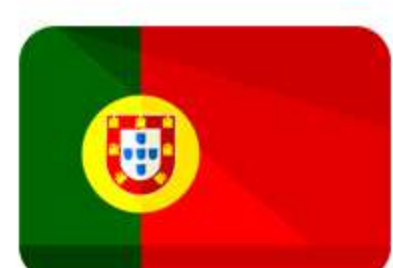
RUI PEDRO BRÁS